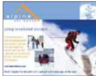
An example of a publication that has been extensively customised from a template in Publisher 2003.

Microsoft Publisher was designed especially with the needs of the small-business user in mind, including business owners, managers, and marketers. If used effectively, it can provide a useful tool to help create professional-quality sales, marketing, and business-communication materials—without the cost of expensive outside agencies.